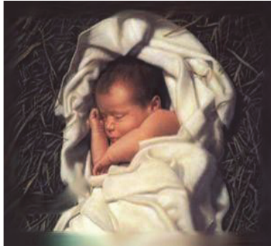
The Holiest of All